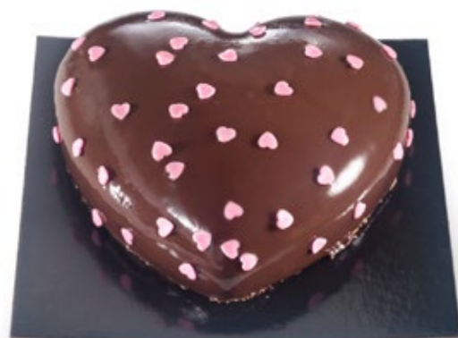
CAKE HEART CHOCOLATE VALENTINE 650g/τμχ