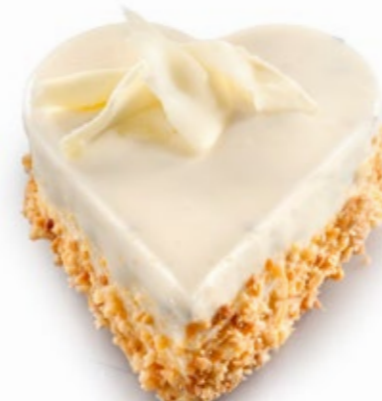
ALMOND HEART INDIVIDUAL CAKE