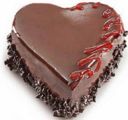
CAKE CHOCOLATE HEART INDIVIDUAL