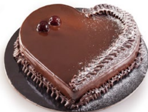
CAKE HEART BLACK FOREST 800g/τμχ