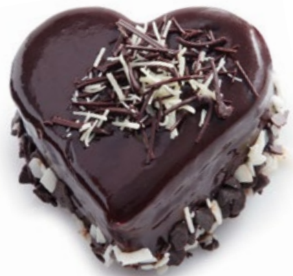
CAKE MIXED HEART INDIVIDUAL