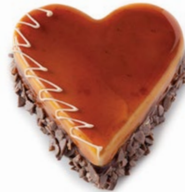
CHOCOLATE CARAMEL HEART INDIVIDUAL CAKE