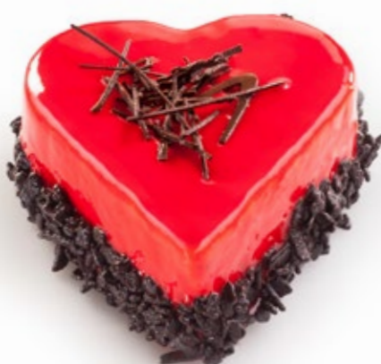
CAKE CHOCOLATE STRAWBERRY HEART INDIV.