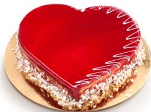
CAKE HEART CHOCOLATE 850g/τμχ