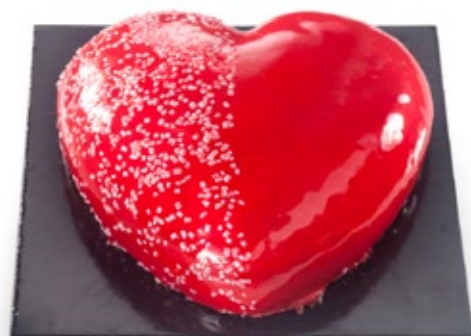
CAKE HEART RED VALENTINE (CHOCOLATE STRAWBERRY) 650g/τμχ